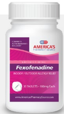
Fexofenadine (Allegra®) 180mg / 30 Count